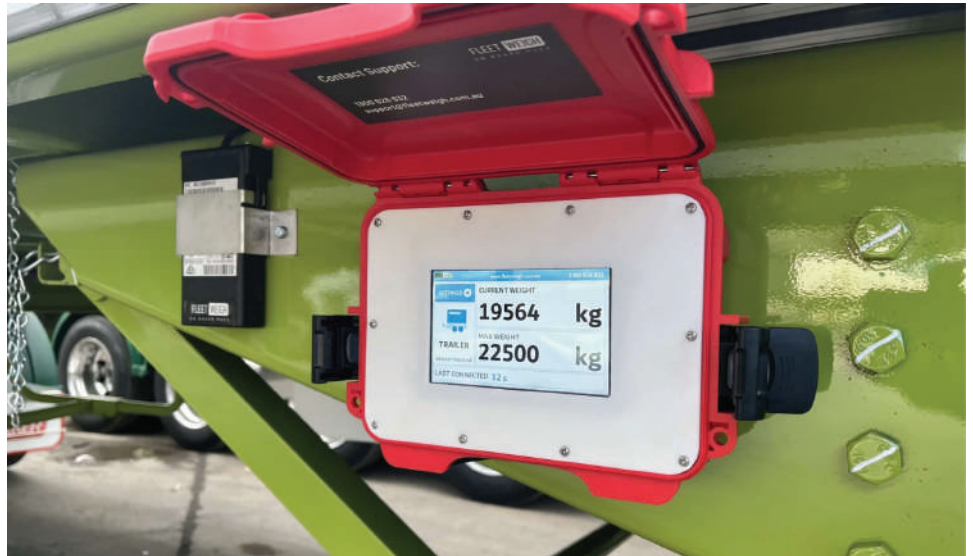
Twelve trailers were recently fitted with a wireless, Bluetooth-enabled, Intelligent TrailerDISPLAY screen.

Tasman Logistics has already implemented WHG's FleetMAX telematics with CANBUS ECU diagnostic tools, FleetWEIGH Smart OBM, and FleetCAM AI video telematics to support safety and combat fatigue. The plan is to expand the WHG tech stack into more areas of the business.